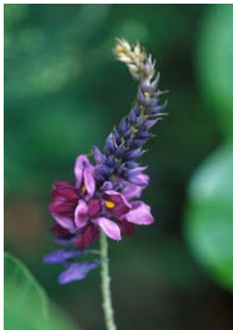
Flower of Pueraria lobata or kudzu or Gegen

The research paper described how puerarin, isolated from the plant Pueraria lobata (also known as Gegen in traditional Chinese medicine), was mixed with collagen matrix and used as a bone graft to fill holes made in the skull bone of rabbits. For comparison, some holes were left untreated, and some holes were filled with a graft of collagen matrix alone.